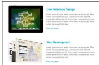
Image galleries, project pages, forms social gadgets, media – all are easy to incorporate

With CMS you can also personalize content for different audiences